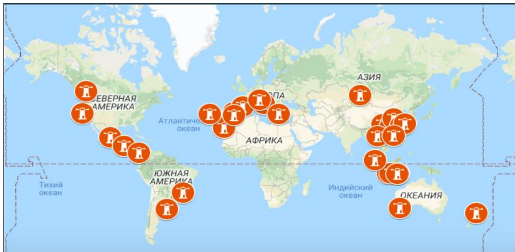
Fig. 3. International Network of Sustainable Tourism Observatories as of 30.11.2020 (UNWTO INSTO, 2020)

reserve fund increased the most in Rivne (by 22018.21 ha), Kherson (by 15911.84 ha), Zaporizhia (by 13115 ha), Lviv (by 12800.6471 ha), and Zakarpattia (by 11716.2 hectares) regions (Pryrodno-zapovidnyi fond Ukrainy, 2020). The volume of protected areas should increase to the European average (about 21% of the country's total area (Zakon Ukrainy, 2019).