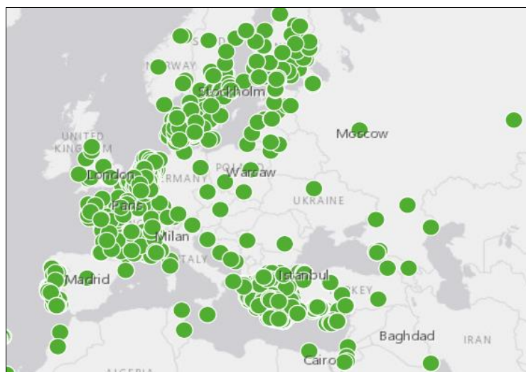
Fig. 2. Hotels in Europe that received the "Green Key" certificate in 2020

EA certification programs are based mainly on the self-assessment model. The certification process takes place in several ways: 1) remotely by documentary verification; 2) personally by an expert who travels to destination destinations; 3) by a comprehensive independent third-party audit. EA certificates cover all components of sustainable development. Climate Action Certification aims to reduce carbon emissions and implement measures to adapt to climate change. The Respecting Our Culture Certification confirms the implementation of procedures that protect cultural authenticity at the local level (Ecotourism Australia, 2020).