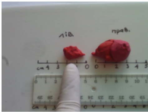
Fig. 1. Methods of morphometry in vivo of palpation diagnostics data using life-size volumetric ovarian models

ers under the influence of the normalization of metabolic processes, including hormonal processes in the body (Roman et al., 2020).